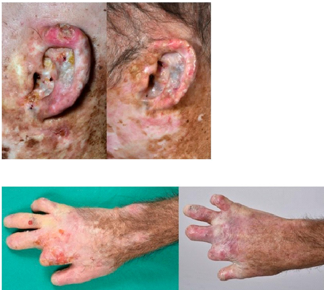
FIGURE 1 Cutaneous lesions of the ear and the hand before (on the left) and after (on the right) the allograft.

in Figure 1. Pain has disappeared, sclerotic skin lesions reduced with no discomfort anymore. Photosensitivity disappeared and the patient is now able to swim and to wear t-shirt. 'It's a new life!', as he said. The patient is now considered cured of his disease and has a normal life that he can share with his wife and his two daughters.