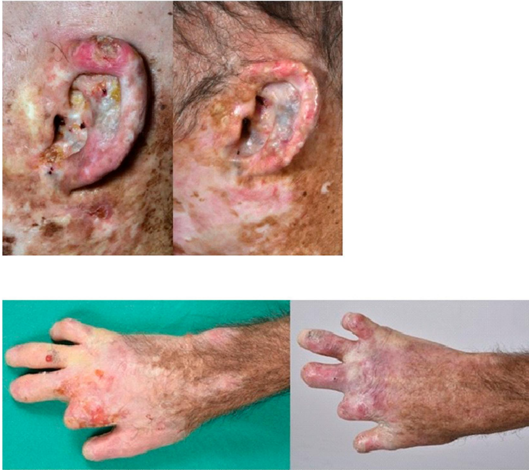
FIGURE 1 Cutaneous lesions of the ear and the hand before (on the left) and after (on the right) the allograft.

in Figure 1. Pain has disappeared, sclerotic skin lesions reduced with no discomfort anymore. Photosensitivity disappeared and the patient is now able to swim and to wear t-shirt. 'It's a new life!', as he said. The patient is now considered cured of his disease and has a normal life that he can share with his wife and his two daughters.