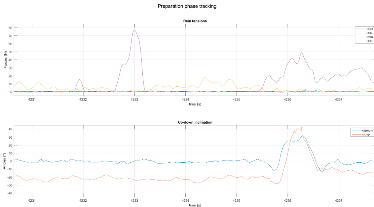
Figure 2. (Top) tensions of left curb rein (LCR), right curb rein (RCR), left snaffle rein (LSR), right snaffle rein (RSR), and (bottom) sternum and croup inclination angles. For the sternum, a positive inclination angle can be equated with a nose-down orientation and a negative inclination angle can be equated with a nose-up orientation of the forehead. For the croup, a negative inclination angle can be equated with a croup-down orientation. The two blue dotted lines mark the preparation phase (from the end of the peak LCR tension to the beginning of the rotation of the forehead) of a croupade.

The statistics were processed using Xlstat (Addinsoft®.2022.1.2). The data were assessed for normal data distribution via the Shapiro–Wilk test. Only seven variables follow the normal distribution (LCR_mean, LCR_std, FE_croup, FE_croup_mean, F_peaks, and H_peaks). Non-parametric tests were therefore chosen to describe the écuyer –horse interaction and to evaluate the “ écuyer ” factor, the “type of exercise” factor, and the “quality of AAGs” factor (satisfactory vs. unsatisfactory, expressed by the two écuyers during their interviews), more precisely the Mann–Whitney U test ( p < 0.05 ) and the Spearman’s test for correlations between variables.