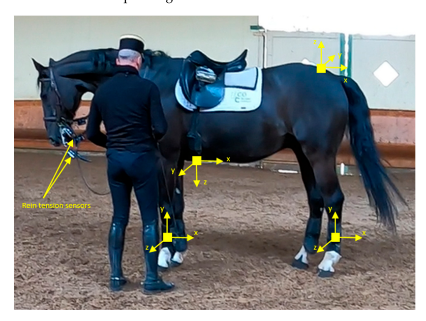
Figure 1. The horse is equipped with six IMUs (one on each limb, one fixed against the sternum, one glued on the croup) and four rein sensors (left and right curb reins and snaffle reins).

Each horse was equipped with six inertial measurement units (IMU) (Shimmer3 IMU Unit, Shimmer Sensing, Dublin, Ireland) (Figure 1). The Shimmer3 IMUs were composed of several 3D accelerometers, a 3D gyroscope and a 3D magnetometer, and an integrated motion processor for onboard 3D orientation estimation (Madgwick algorithm), and sampling at 256 Hz. One IMU was glued on the croup with tape. The position, identified visually, corresponds to a part of the anatomy with a rather flat surface. This part was located by touch. Another IMU was attached to the girth, against the sternum. The visual verification of IMU locations in the middle, on both sides of the tail, and on the ventral median line was carried out before any recording. As the IMUs are considered to be joined to the anatomical part on which they are fixed, analysis of the IMU on the croup can be considered as the analysis of the hindquarters' movement, and that of the IMU on the sternum as the forehands' movement. The four other IMUs were placed on the two metacarpal and two metatarsal bones. They were fixed by an elastic holster attachment around the boots, bound by tape. The four IMUs of the limbs can weigh up to 200 g, and those of the trunk up to 16 g.