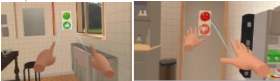
Figure 3: The pictogram system used to collect the effective agreement of the participants.

First of all, it is the autistic participant who makes the choice of the third party who will accompany him or her. It is then the responsibility of this "third-party guide" to verify the effective agreement of the participant, before and during the immersive trial. In order to overcome the subjects' communication deficits, a pictogram system (Figure 3) was designed and implemented in the VR environment. These are presented to them before the VR session. Participants are free to point to any of the pictograms at any time during the experiment or after the actual request of the guide to continue or not. Because some people with autism suffer from echolalia or have great difficulty in reversing, the repetition of the request during the test is important.