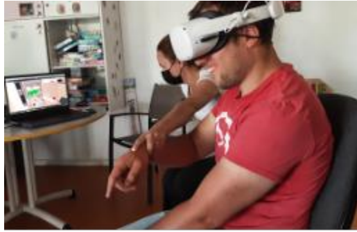
Figure 1: Experimental setup including external screen and third-party guide.