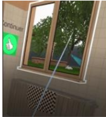
Figure 4: The sensory resting space, a window to a peaceful outer world.