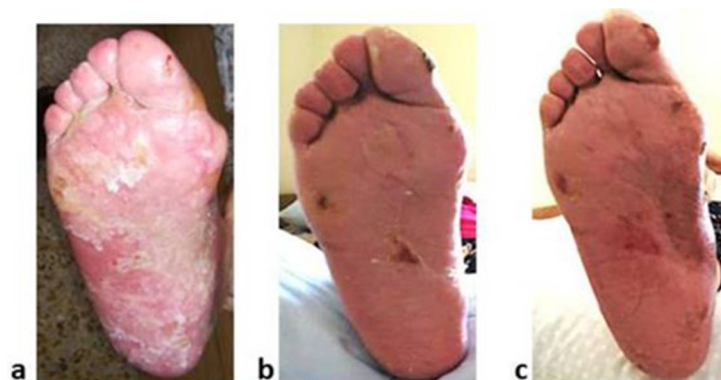
Figure 1. Pictures of grade 4 HFS developed by patient 2. The pictures were taken at different times: (a) after 15 cycles of capecitabine when the patient was concomitantly assuming folate supplementation; (b) following discontinuation of capecitabine and folate supplementation; (c) after capecitabine restarting.

demonstrating a progression of the disease with an increase in the number and diameter of tumour liver lesions. Capecitabine treatment was stopped, and a new treatment with trifluridine/tipiracil was started.