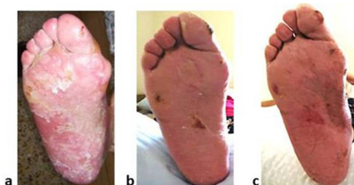
Figure 1. Pictures of grade 4 HFS developed by patient 2. The pictures were taken at different times: (a) after 15 cycles of capecitabine when the patient was concomitantly assuming folate supplementation; (b) following discontinuation of capecitabine and folate supplementation; (c) after capecitabine restarting.

demonstrating a progression of the disease with an increase in the number and diameter of tumour liver lesions. Capecitabine treatment was stopped, and a new treatment with trifluridine/tipiracil was started.