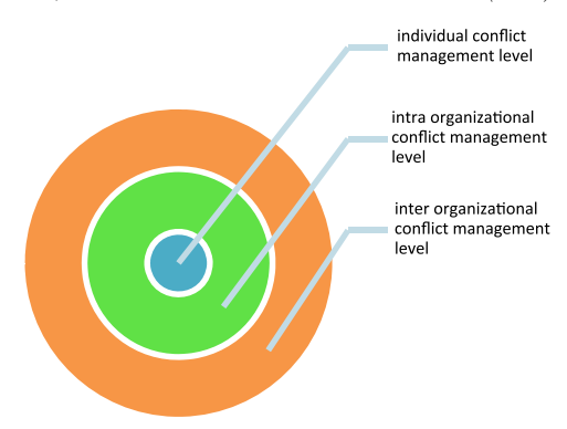
Fig. 4. The three levels of conflict management.