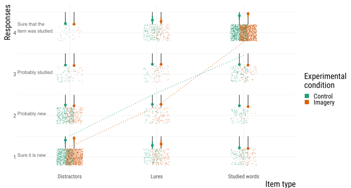
Figure 1. Responses as a function of item type and experimental condition.

and Condition as a between-subject factor (control vs imagery, respectively coded 0.5 and -0.5) as well as their interaction as fixed factors and varying intercepts for participants and items (words) in the model. The dependent variable was the response of the participants (1, 2, 3, or 4). Data analysis was performed with the brms R package (Bürkner, 2018). Dispersion of each participant's responses as a function of item type and experimental condition is depicted in Figure 1.