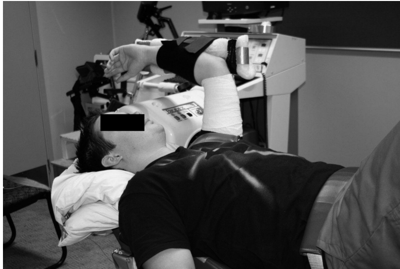
Figure 1. Participant positioned in the dynamometer for strength testing and perturbation testing.

Thereafter, participants performed 3 maximal-effort contractions and rested for 2 minutes between repetitions. The duration of each MVS trial was 6 seconds. Standardized oral encouragement was provided throughout the maximal effort. The highest torque of the 3 trials provided the MVS for later calculations.