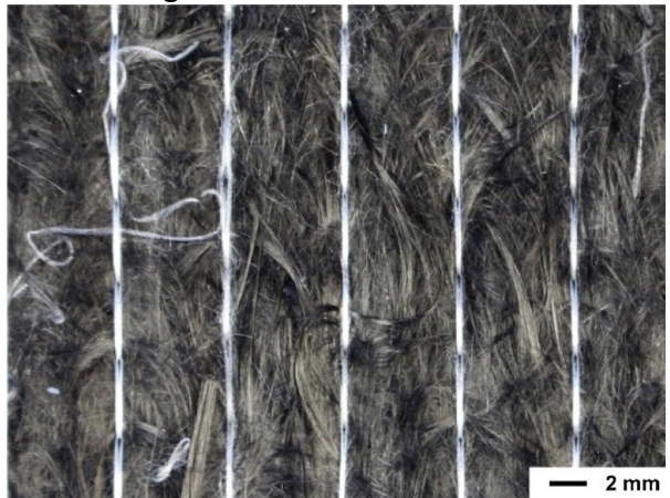
Figure 1: reclaimed carbon fibre bed [